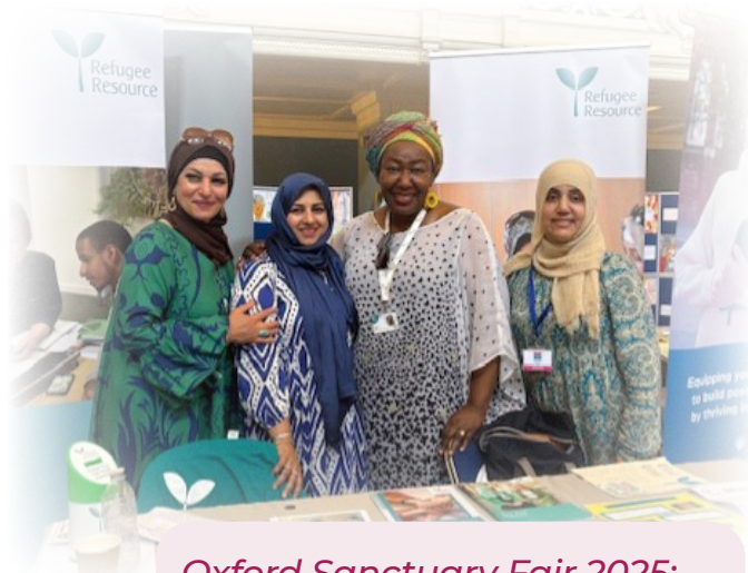
Oxford Sanctuary Fair 2025: Community as a Superpower.

Based on close collaborations with lived experience organisations the Council has been actively involved in providing more inclusive and holistic support for people seeking sanctuary. We are proud to celebrate refugee experiences through Refugee Week celebrations and the annual Sanctuary Fair. So, while we aim to do better with regards to our statutory duty, our overall approach and plan is to go beyond business as usual.