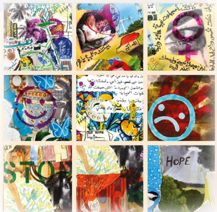
Windows painting created by the residents of local asylum hotels, supported by Iraqi Women Art and War, hosted by the Museum of Oxford and displayed at Oxford Town Hall for Refugee Week, 2024

Our vision for Oxford City Council as a local authority of sanctuary is to create a welcoming and safe environment where those seeking sanctuary feel supported, accepted, and embraced as part of the broader community. A city where all residents can thrive, contribute, and actively participate in the community, helping to shape the future and enrich the life of Oxford for all.